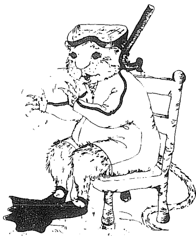
2. The gopher in a wetsuit.

Boys and girls in junior grades will find adventure, some mystery, and lots of humour in Puffin Rock . The writing is concise and simple. Children will enjoy and learn from Lundigan, as he grows from a hesitant youth to a boldly brave young adult.